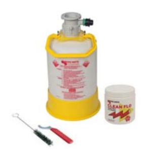
Kegerator Pump Draft5 Litre PressurizedBeer Line CleaningCleaning Kit - DKitSystem$62.99$159.99(http://www.kegerator.com(http://www.kegerator.com