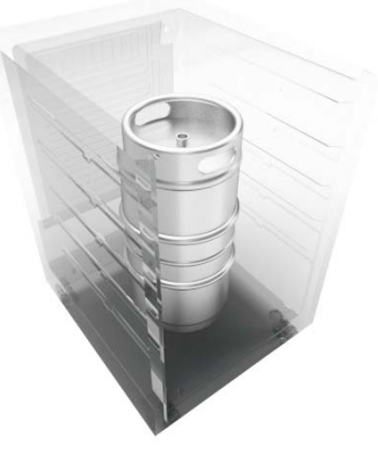
(1) Slim Quarter Keg