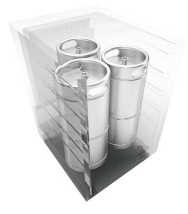
Up to 3 Sixth Barrel Kegs