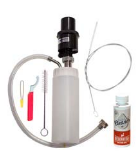
Kegerator Draft BeerKegerator Pump DraftLine Cleaning KitBeer Line Cleaning$34.99Kit(http://www.kegerator.com$62.99/kegerator-draft-(http://www.kegerator.com