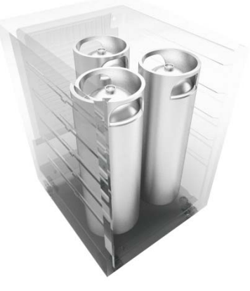
Up to 3 Cornelius Homebrew Kegs